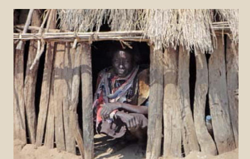
Woman Looks At The Visitors