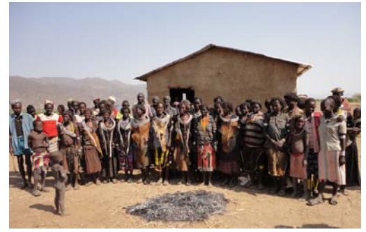
New Church Established in Omo Valley

Ancient Tribes of the Omo Valley: Home to some of the most fascinating people in Africa, we have established another new church in a land where the only previous religious practice was witchcraft and tribal deities. In this remote region close to the border of Ethiopia and Sudan, there are no permanent structures. With virtually no shade, it is important that we establish each new church with a building so the people have a place to meet.